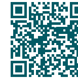
Learn more about the Phase 3 clinical study

The cell surface protein HER2 controls cell growth, differentiation, and survival, which are essential functions in human development processes. A malfunction or over-expression can promote aggressive cell growth resulting in formation and spread of tumors. 1